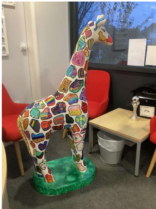
5 - Gerald the Giraffe all ready to be collected...

4 - We are asking children to bring in a voluntary donation of £1 on Thursday 7th December, and wear a Christmas jumper. Remember, you don't need to necessarily buy a brand new jumper for this event as children could decorate an old jumper instead.