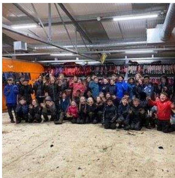
2 - Our lovely Year 6 pupils at the end of the Grafham Water Challenge. Muddy kids are happy kids!