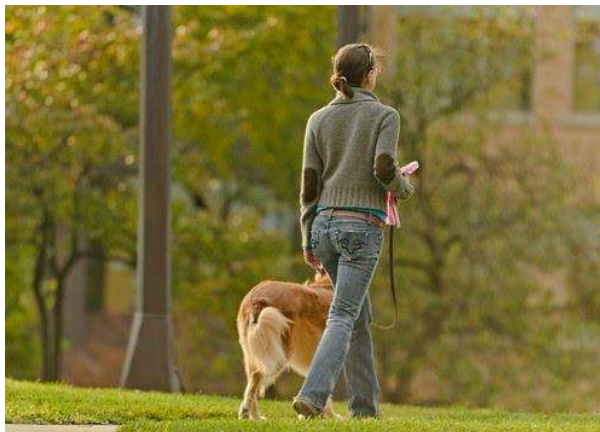
2 - Reminder that dogs are not allowed on the school grounds.

If any of you go, please let her know if you enjoyed it, or if you wanted advice of how to get your child into drama clubs.