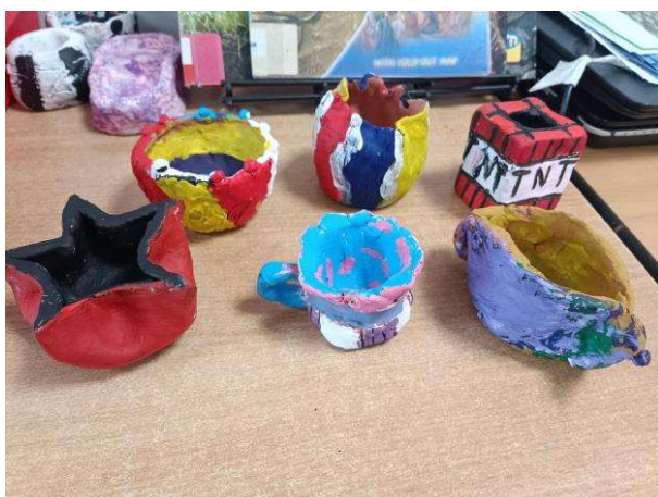
2 - Maple Class Greek themed pots