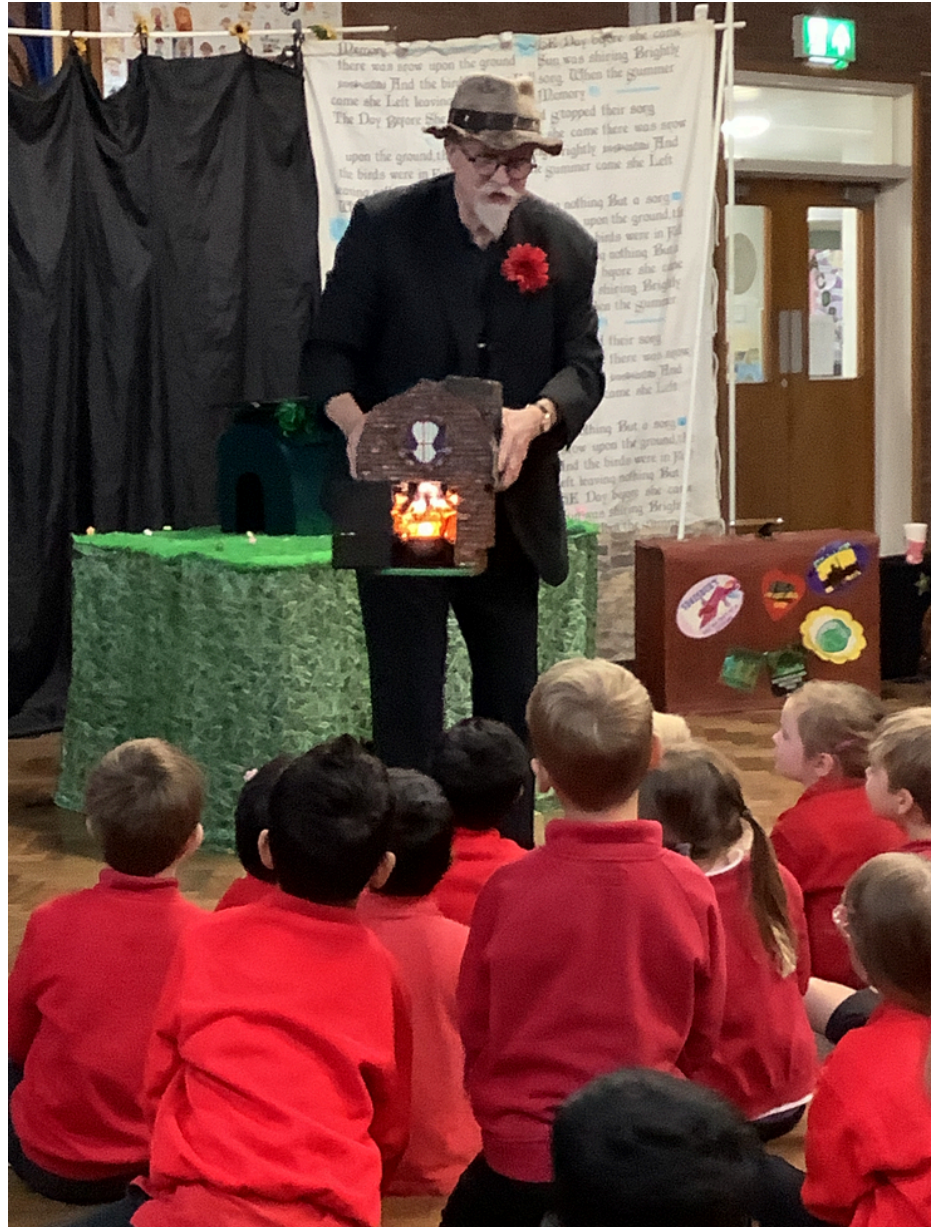
Reception and Key Stage 1 pupils enjoying a theatre production experience